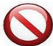
Don't post it!